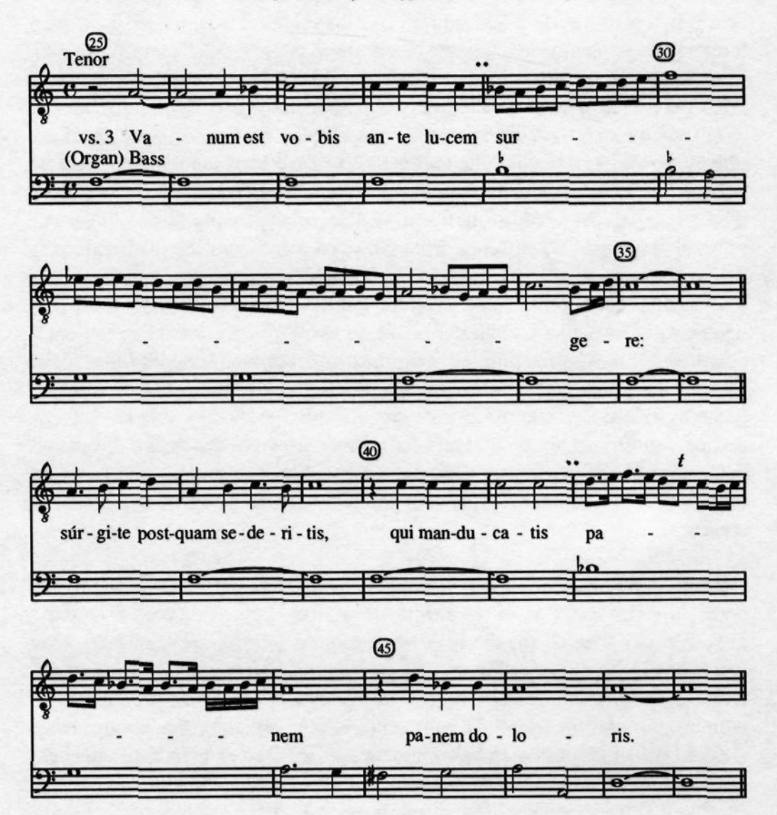
Ex. 5. Conforti, Salmi (1602), "Nisi Dominus," verse 3