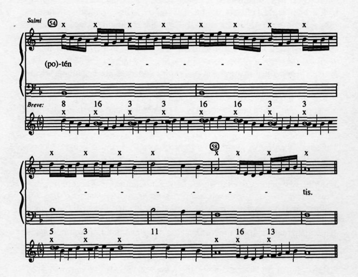
Ex. 4. Comparison of Salmi and Breve Embellishments

The mediant cadence of this same verse (5) shows a three-measure embellishment of the b-flat triad (54-56) followed by the embellishment of a fourth down (57-58), and of a unison (58) and an ascending third (58-59). For the long b-flat triad (54-56) Conforti embellished the notes d to b-flat (third down), b-flat to b-flat (unison), b-flat to d (third up), d to c (step down), and c to d (step up). All embellishments are taken from the Breve .