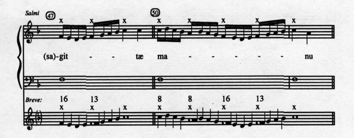
Ex. 3. Comparison of Salmi (1601) and Breve (1593) Embellishments

All of the embellishments in "Nisi Dominus" are taken from the Breve. Conforti did exactly what he had advised his students to do—find out what notes (intervals) need to be embellished and then embellish them with appropriate and attractive ones drawn from the Breve. In looking at a few measures from one of the more complex verses of Ex. 2 (verse 5), it is obvious that in m. 47 (and its "echo" in m. 48) Conforti embellished the notes f to f (a unison) and f up to c (a fifth up), and that in m. 50 (and its "echo" in m. 51) the notes c-a-f-f-c (two thirds down, a unison, and a fifth up), all notes based on the triad built on the bass note f, which in its turn was the bass for the ideal chant melody (the recitation note c). Each of these embellishments is made up of a stringing together of smaller embellishments found in Conforti's Breve. In Ex. 3 the vocal embellishments from verse 5 (Ex. 2) are placed on the top line, the organ bass on the second line, and the short exercises from the Breve on the third. (The numbers above the Breve part give the pages on which these short embellishments are found; they have been transposed, their rhythms simplified, and asterisks added to indicate the basic pitches being embellished.)