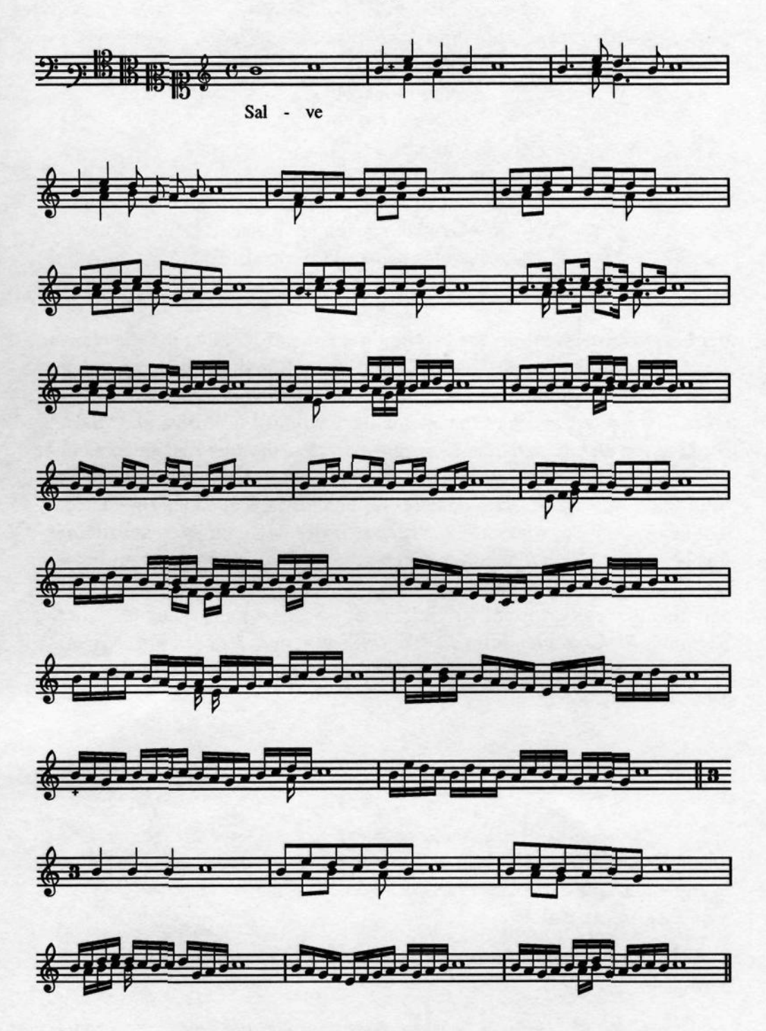
Ex. 1. Conforti, Breve (1593), embellishments of an ascending second (p. 3)